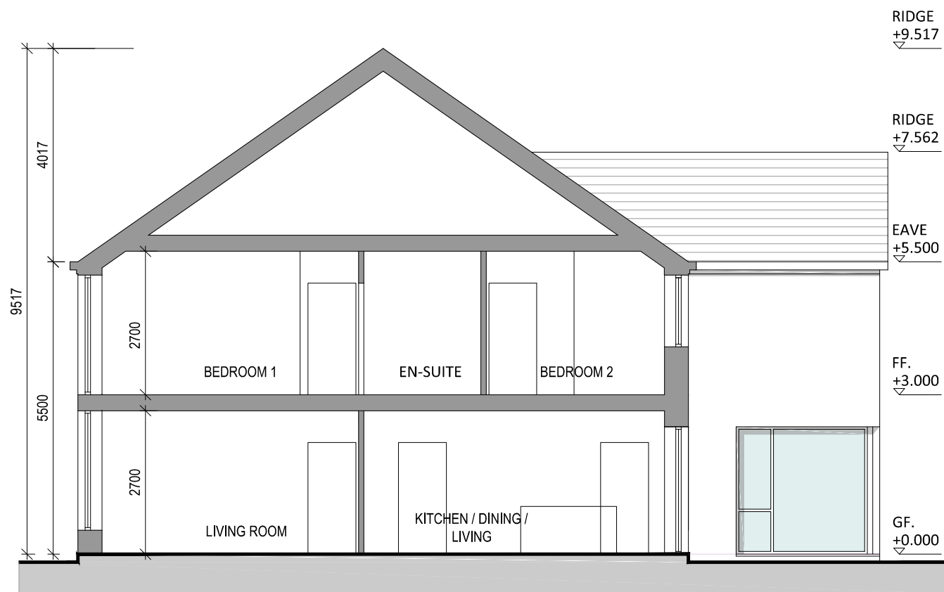
SECTION A-A scale 1:100