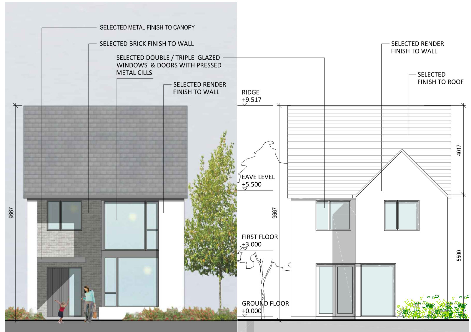
FRONT ELEVATION scale 1:100